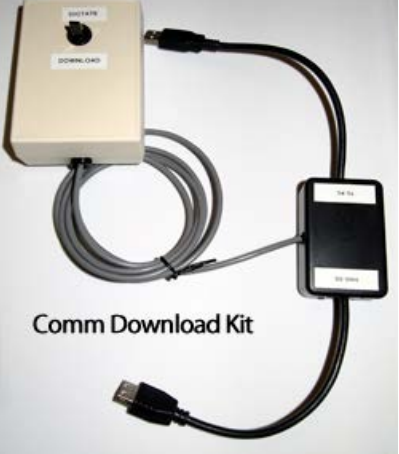
Includes Qty 1 Dictate/Download Switch and USB Extender Kit (up to 130 feet from Dictation Workstation to PC)