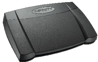
Reliable, Ergonomic USB Foot Pedal

Skip Forward or Backward a precise number of words, with automatic highlighting of each word as it's spoken, with precise foot pedal control.