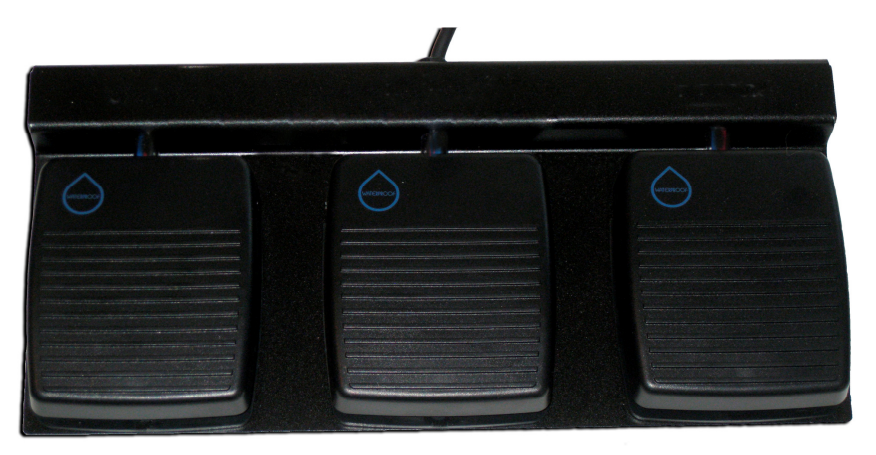
For USB Foot Pedals

VERSION 3.0.2 -With Pedal Release Actions and Infinite Repeat Functions