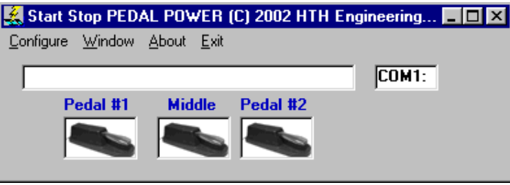
Control Panel for the SSPP