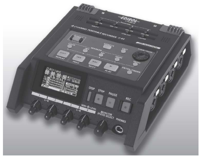
Roland<sup>TM</sup> R-44 Solid-State 4-Channel Recorder