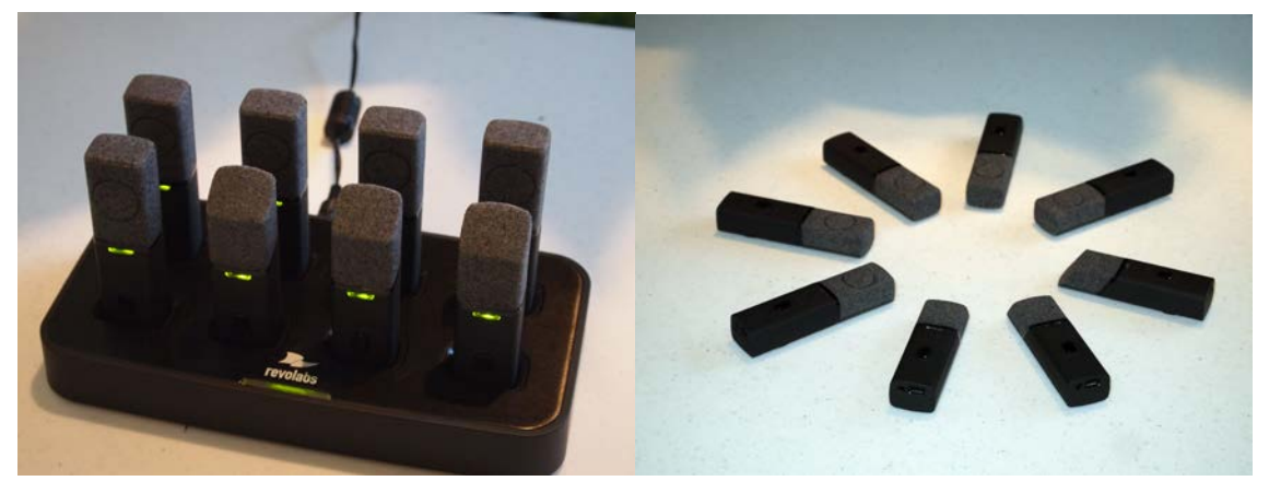
Microphones can be supplied in Directional and Omnidirectional models (any mix specified).

8 Microphone/4-Channel System Executive HD 8-Channel System shown with Charger Base, and Directional and Omnidirectional HD Wireless Microphones with R44 Recorder.