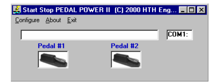
Control Panel for the SSPP

9) Select Configure from the menu, then COM Port, and select the COM port that matches the serial port that your SSPP is plugged into. A typical portable (notebook or laptop) PC will use either COM1: or COM2:. If you aren't sure, try COM1: first. Press the pedals and look for the photo of the pedal to animate (move) in sync with your foot. If no pedals move, then try