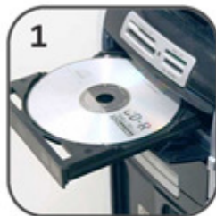
1 Insert CD