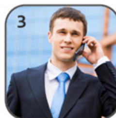
3 Dictate from any phone