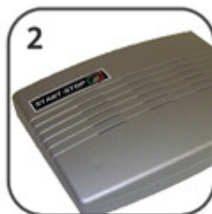
2 Plug in the USB Telephony Box