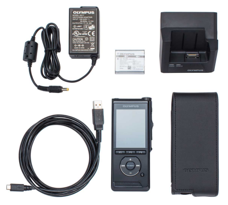
Includes Includes DS-9500, 2GB, CR-21 LAN/USB charging, download cradle, LI-92 lithium-ion battery, a-517 AC power adapter, KP-30 USB cable, ODMS R7 Dictation management Software, latest version, User manual, Quick Reference Guide