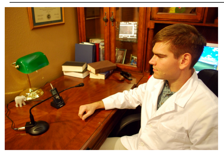
Crystal-Clear Digital Dictation with Gooseneck Microphone and Olympus DS-9500 Recorder