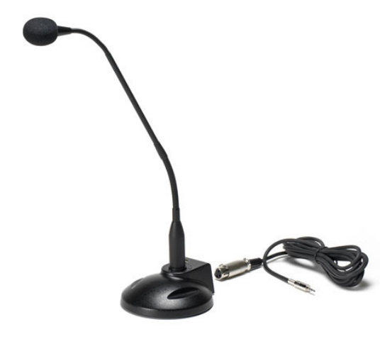
GN-1 Gooseneck Microphone with Unidirectional Pickup and 10 foot cord