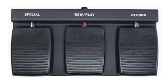
Heavy Duty Footpedal with separate pedals for Record/Play, Rewind, and "New" file designation