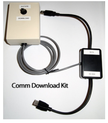
COMM Download Kit

Includes Qty 1 Dictate/Download Switch for instant download to transcriptionists