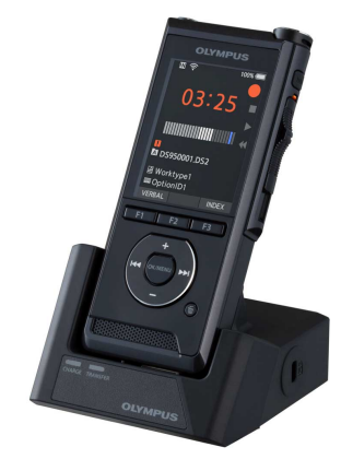
DS-9500 Digital Recorder With Cradle