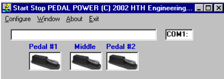
Control Panel for the SSPP