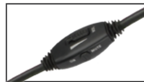
In-line Volume Control