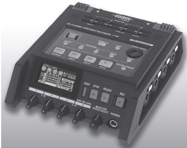
Roland™ R-44 Solid-State 4-Channel Recorder