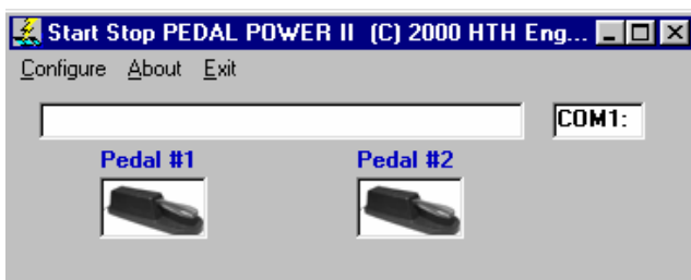
Control Panel for the SSPP