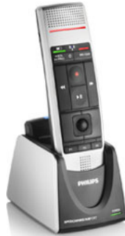
Philips SpeechMike Air Bluetooth Wireless