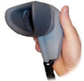
Sylencer Speech Mask