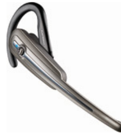
Calisto Bluetooth Wireless Headset