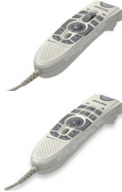
Philips SpeechMikes Pro and Classic