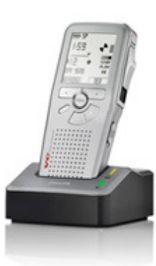
Philips DPM 9600 Professional Dictation Recorder