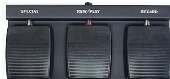
Heavy Duty Wide-Spaced Pedals