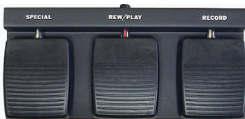
Heavy Duty Footpedal with separate pedals for Record/Play, Rewind, and "New" file designation