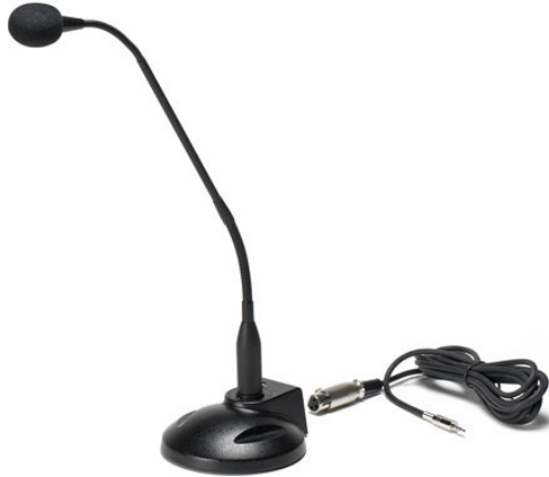
GN-1 Gooseneck Microphone with Unidirectional Pickup and 10 foot cord